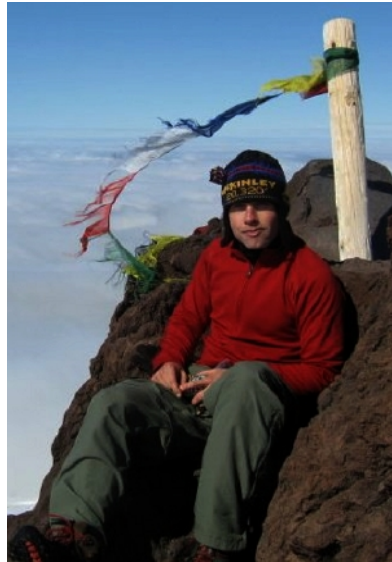
Near the summit of Mt. St. Helens